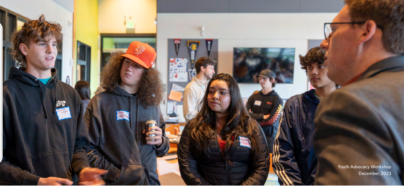
Youth Advocacy Workshop December, 2023

For more than 50 years, schools and communities have counted on Educational Service District 112 for essential services. Working collectively with our school and community partners, we bring equity and opportunity to the students of Southwest Washington and beyond.